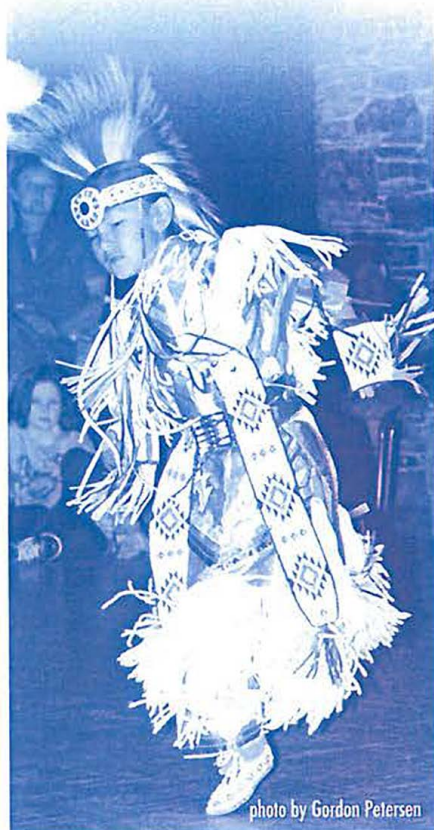
Traditional dancers performed for workshop participants

Imagine you're driving alongside a river and you see a few people drowning. You pull over, rescue them and begin resuscitation, only to look up and realize there are two more people coming down the river. This continues and there are more people like you pulling over to rescue the drowning people. To simply continue to resuscitate these