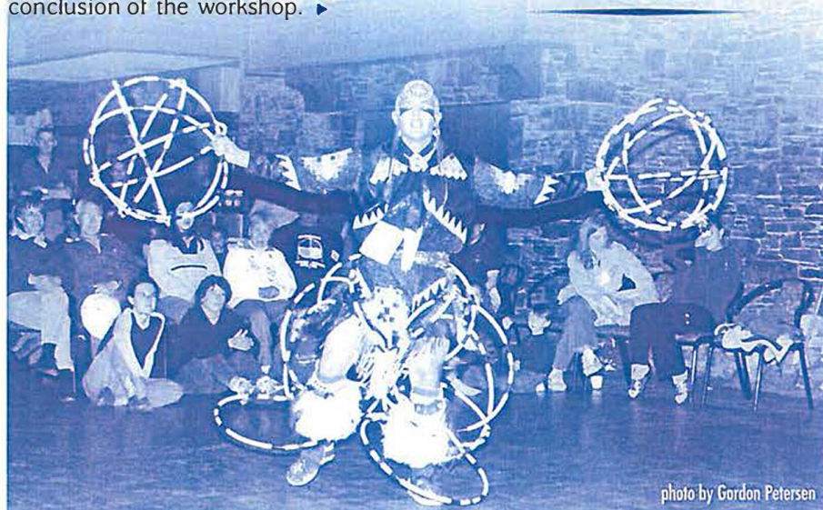
Traditional dancer performed hoop dance

"And I encourage physicians to keep trying. It's simple and yet so hard to connect and to encourage patients to take responsibility for their health."