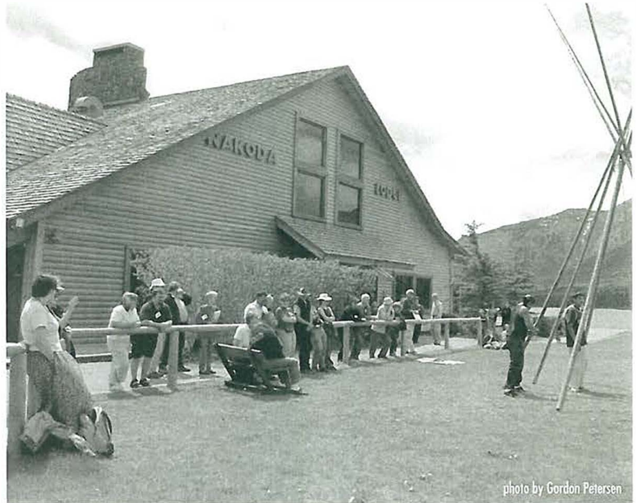
Physicians and their families watched teepees being raised for small group sessions

individuals wouldn't address the real problem – the bridge upstream has a hole in it.